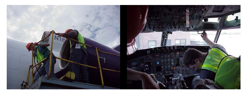
Figure 1: AT 402 Live Laboratory

To effectively implement and evaluate the use of industry-based SMS principles within an aviation technology laboratory curriculum, it was necessary to utilize a course that closely approximated an industry operation. As a senior level capstone course, AT 402, Aircraft Airworthiness Assurance, was an ideal candidate course. The course offered an intensive and challenging learning environment designed to challenge students' ability to incorporate management and technical skill sets within a realistic aircraft maintenance environment. The course utilizes Purdue University's two large transport aircrafts (Boeing 737 and Boeing 727) to simulate a large scale aircraft maintenance operation. Both aircrafts had fully functional engines and systems. While non-flying, these aircrafts offered an excellent simulation as live laboratory platforms for practicing industry standard maintenance procedures, as shown in Figure 1. In this class, senior students in the Aeronautical Technology Maintenance program learn to function as operations managers and team leaders, while simultaneously integrating the knowledge, skills, and abilities of technical aircraft maintenance practices acquired throughout the undergraduate Aviation Technology program. Students in AT 402 are tasked with researching, planning, and implementing a large aircraft production maintenance operation using the same tools, required safety equipment, and practices as those in the industry.